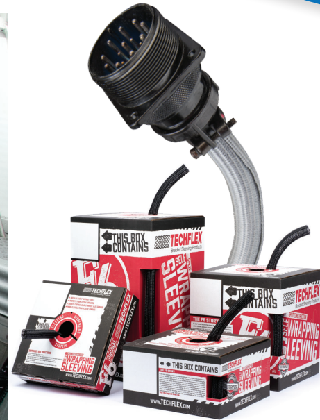
F6® is available in self-dispensing boxes.