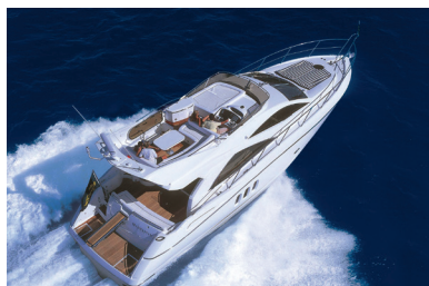
L6N is ideal for marine and automotive wiring harnesses.