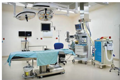
The fluid resistance of Liquid Wrap sleeve makes it ideal for cable management in medical applications.