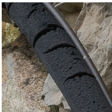
Protect your HVAC foam insulation from harmful UV rays with Dura HVAC Wrap.

With the introduction of new building code regulations regarding protection of foam insulation on HVAC line sets, Techflex® has developed a new lightweight wrap to assist installers with code compliance. Our new Dura HVAC Wrap is constructed of a tightly woven breathable polyester shell that offers protection from wind, rain, mildew, UV rays and abrasion. The extra wide hook and loop closure assists in covering multiple diameters quickly and easily for a tight fit.